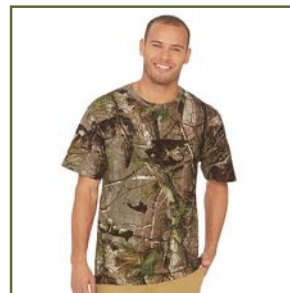
Code Five Adult REALTREE® Camouflage T-Shirt #3980