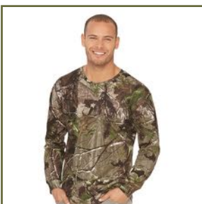
Code Five Adult REALTREE® Camouflage T-Shirt #3981