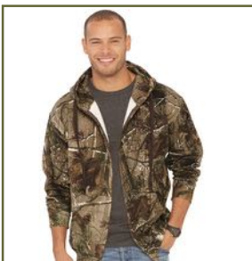
Code Five Adult REALTREE® Camo Zip Fleece Hoodie #3989