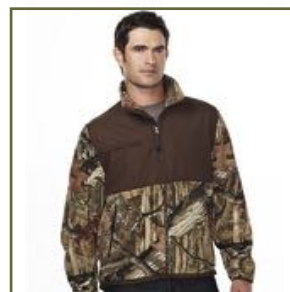
Frontiersman Camo Jacket #7450

S-XL: $28.00 2XL: $30.00 3XL: $32.00 4XL: $34.00