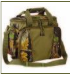
UltraClub by Liberty Bags Camo Hunting Cooler #5561

All Apparel will Receive this 2019 Moose Hunt Embroidered Logo