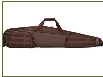
Moosy Oak Rifle Case #Gp10002